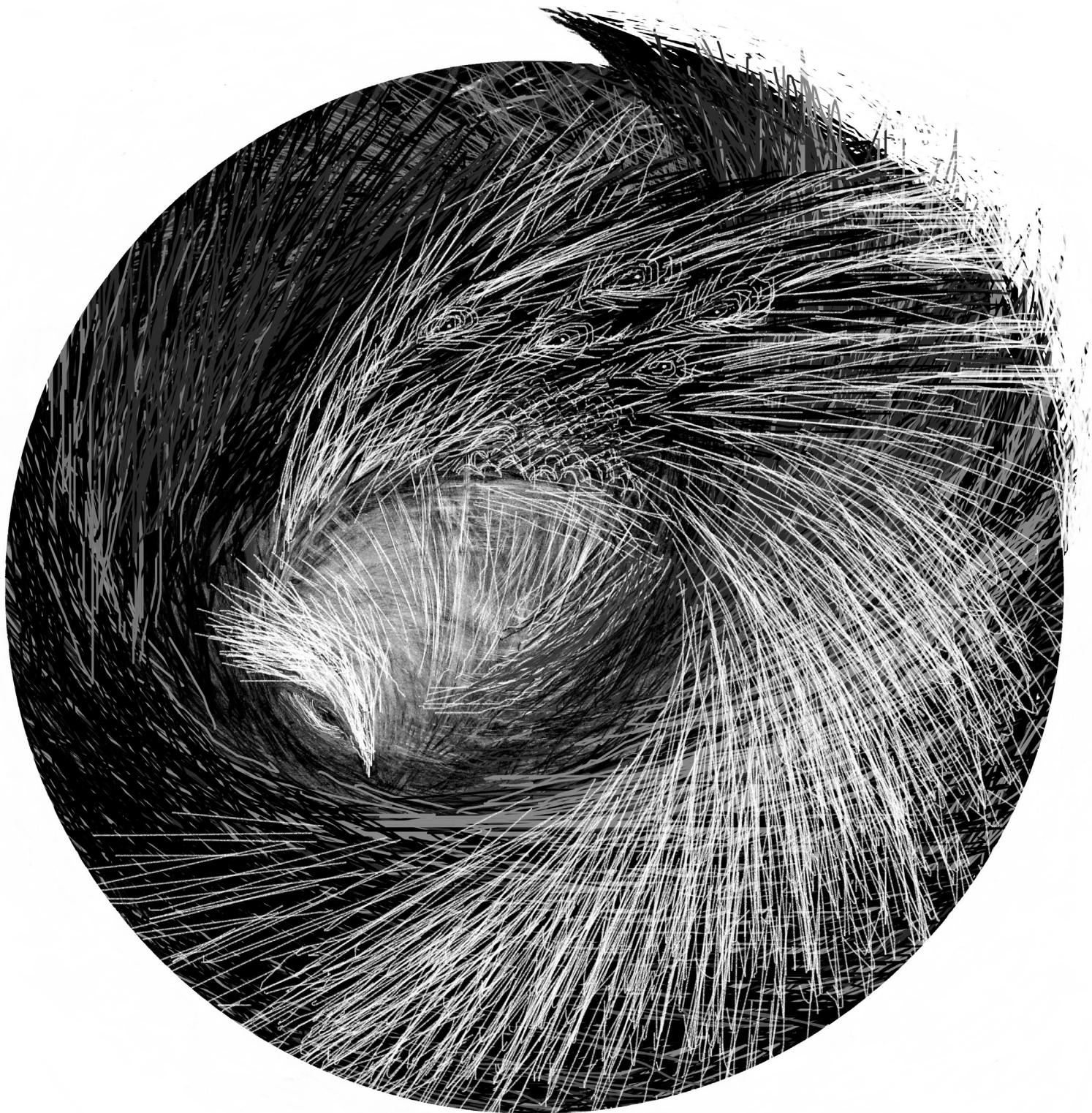
Peacock's eye – yin-yang (dot as an eye's form – circle as a luxurious feather), 2023, Digital drawing, 100 x 100 cm